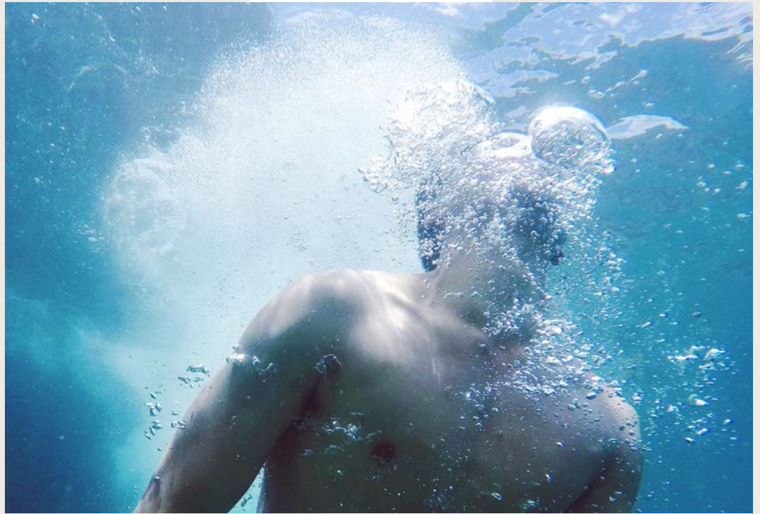
Hypoxia mimetics as novel therapy option.

Kidney injury can result in fibrosis, an excessive scarring of the tissue, which leads to a progressive loss of renal function. Recent research suggests that inhibition of cellular oxygen sensors is a novel therapy option for kidney fibrosis.